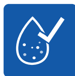
Salt Water Compatible