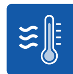
High Ambient Models