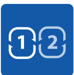
Redundant Refrigeration Circuit