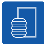
External Pump And Tank